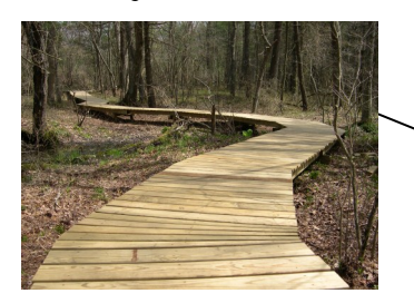
From Churchill Park, a future boardwalk over wetlands will provide public access to Cato's Ridge Conservation Area, the 77-acre town-owned parcel that is currently landlocked.

Plympton is one of only two towns in the Commonwealth with less than 2% of its land designated for conservation. In a 2007 survey of town residents, preserving Plympton's rural character by protecting open space was rated as the top priority. Creating this new park and conservation area would be a major step toward this goal.