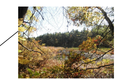
Cato's Ridge covers part of the Plymouth-Carver Sole Source Aquifer. The Town's two watersheds also meet in this area.