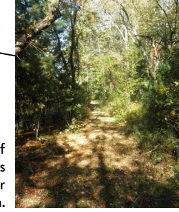
The established network of 100-year-old cart paths makes this an ideal area for non-motorized recreation.